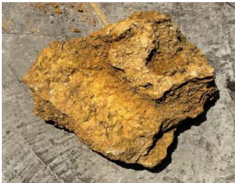
Fig. 1. Appearance of shell limestone

At the first stage of the experimental studies, the effect of the degree of crushing of powdered limestone-shell and its content in the mixture on the strength properties of the mortar part of concrete was examined. The experiments were performed on cement-sand samples — beams measuring 40×40×160 mm with its material compositions modelling the mortar part of the concrete under study.